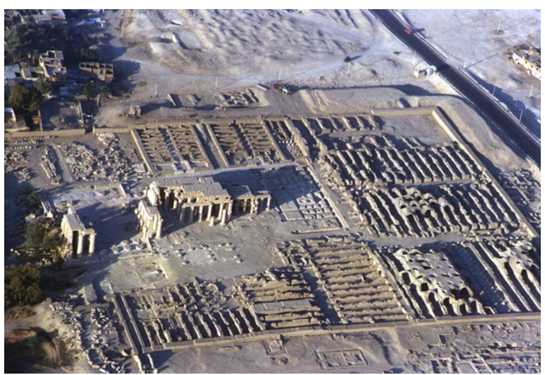
Aerial view of the Ramesseum

At the time of Ramesses II this temple was called "the Mansion of Millions of Years of Wsr-M3't-R' Stp-n-R'<sup>7</sup> (one of Ramesses' names) which United with Thebes (Waset) in the Domain of Amun." Amun was the god who presided over the destinies of the Egyptian empire and who resided in the monumental temple on the east bank, in Karnak and in Luxor.