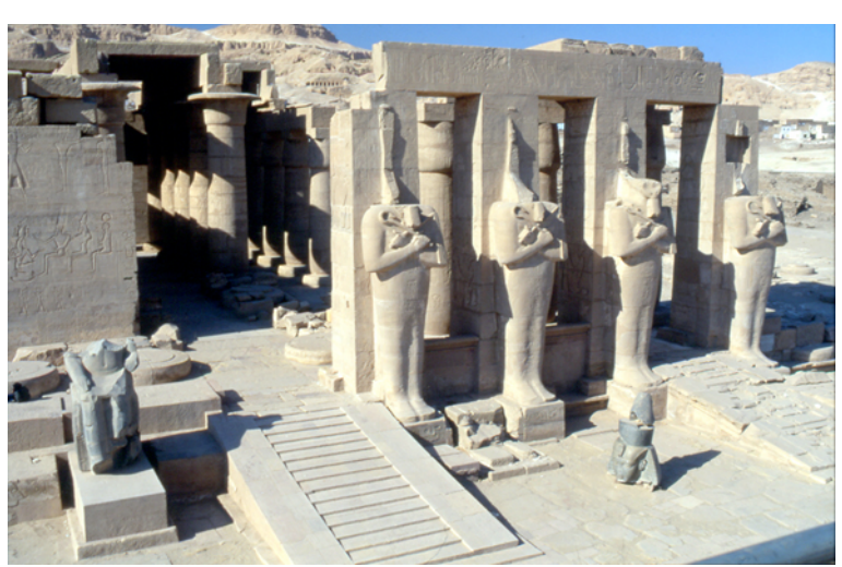
View of the hypostyle hall from the second courtyard

The lower part of the second statue was put back into place. Its upper part was that which Belzoni had shipped away and which is today housed in the British Museum.